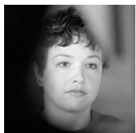
Sabrina Harman Specialist 372 nd MP Company

Megan Ambuhl Graner was a specialist with the 372 nd MP Company who worked as a guard on the night shift at Abu Ghraib. She was prosecuted for not reporting acts of abuse during the fall of 2003. She was sentenced to a reduction in rank to private and a fine; she later received an other-than-honorable discharge.