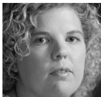
Megan Ambuhl Graner Specialist 372 nd MP Company